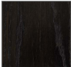
JET BLACK B1907-D612