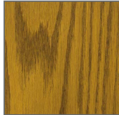
AMBER OAK B1903-D612