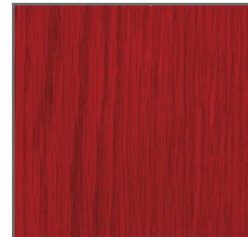
DEEP RED B1910-D612