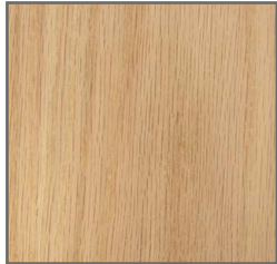
CLEAR BASE B1900-D612