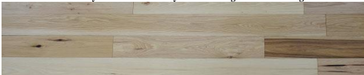
Oak Live-Sawn Factory Finished Engineered Flooring